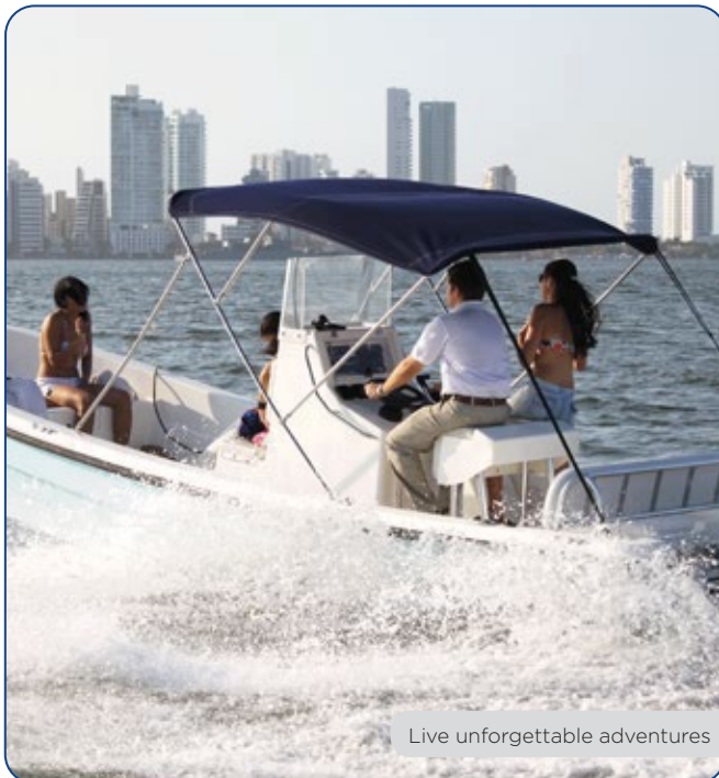
Live unforgettable adventures