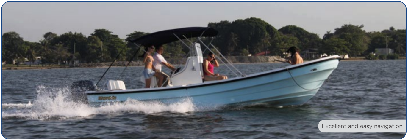
Excellent and easy navigation