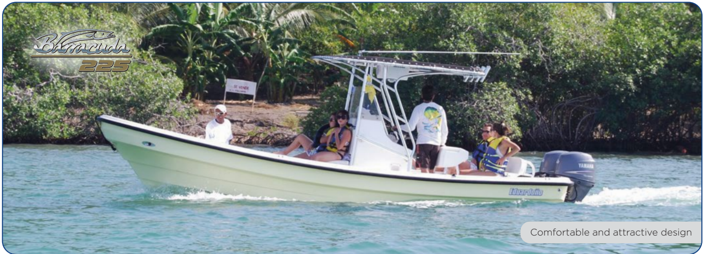
Comfortable and attractive design