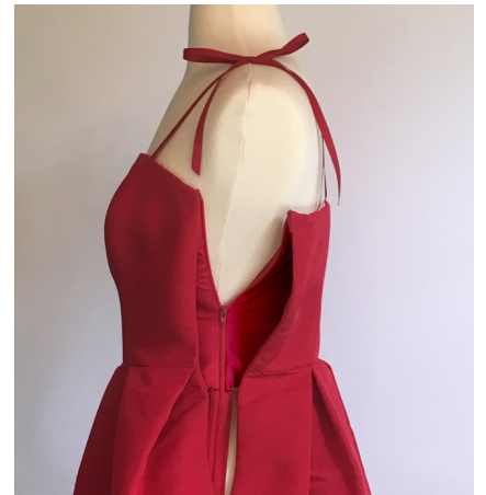
Interior Corset Detail