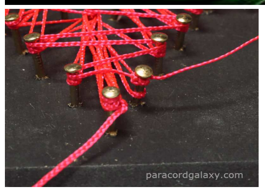
Once you have reached the desired look, tie the end to a nail like at the beginning.