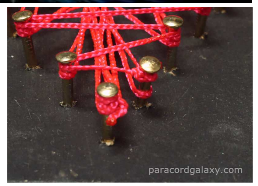
Trim the end of the cord about ¼ inch from the knot. Carefully melt the end until it reaches the knot. Repeat with beginning knot.