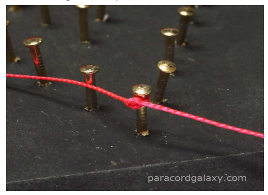
Tie a square knot around one of the nails with one end of the nano cord.

Print a shape or letter and tape it to your board. Hammer nails along the outline leaving even spaces between each.