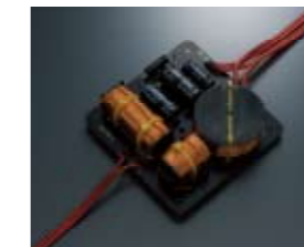
Crossover networks (Bass driver)