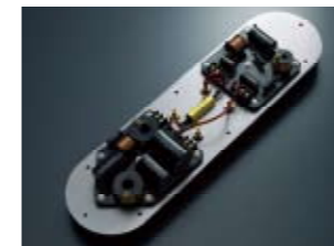
Crossover networks (CST Driver)