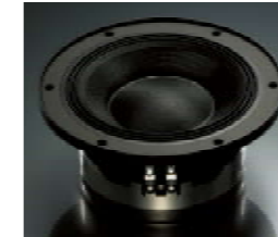
Bass driver unit

The bass driver was designed to achieve total linearity of the magnetic circuit, diaphragm and suspension. The magnetic circuit features our unique short voice coil OFGMS (Optimized Field Geometry Magnet Structure). With a long gap of 20mm (0.8 in.), it linearizes the magnetic flux density along the gap. This stabilizes drive performance from small to large amplitudes, achieving high linearity and consistently accurate waveform reproduction. The TLCC (Tri-Laminate Composite Cone) aramid diaphragm has a triple-laminated construction that provides near ideal physical properties. It delivers rich and clear low-bass with a mid-bass free of coloration. The suspension system employs TAD's traditional corrugated edge, further contributing to the high linearity.