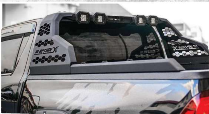
ROLL BAR OPTION-X OP330