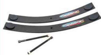
ADD A LEAF