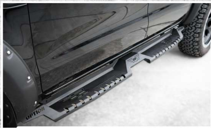
SIDE STEP V.2 OP271-02