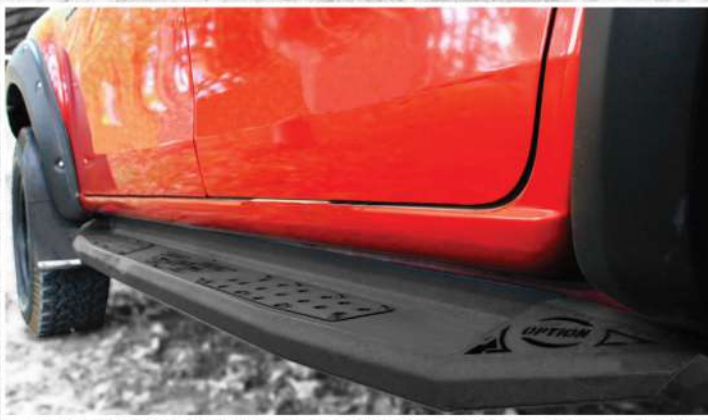
SIDE STEP V.1 OP253