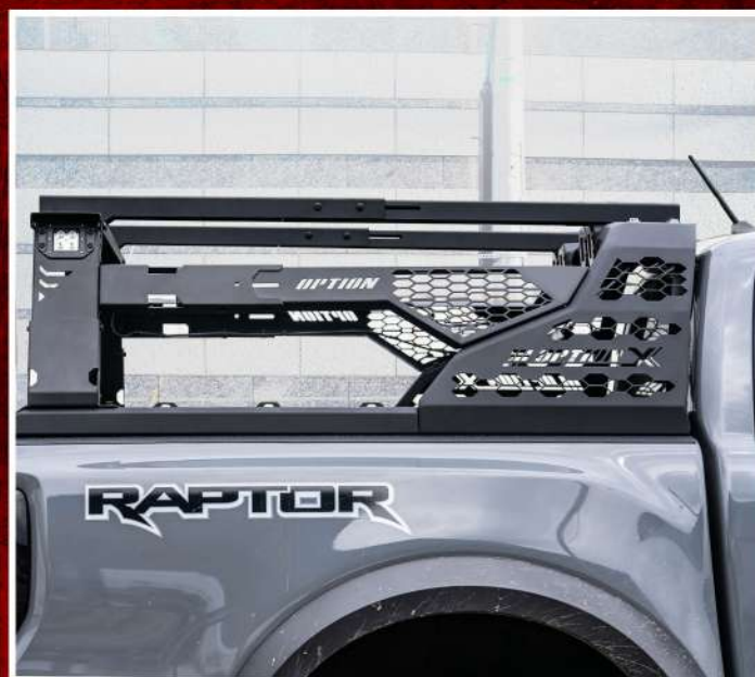
2. ROLL BAR OPTION X & BED RACK