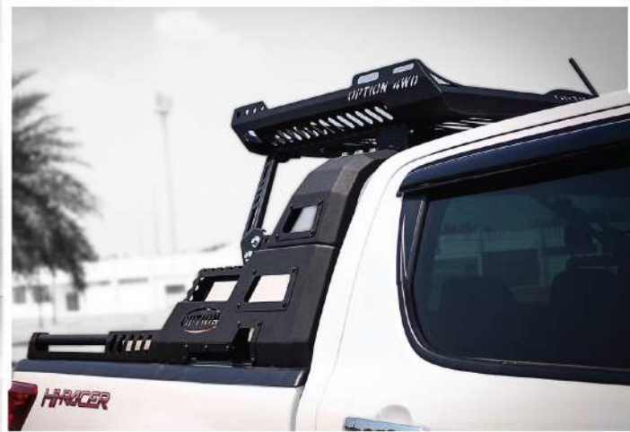
ROLL BAR V.1 WITH ROOF RACK OP237-001