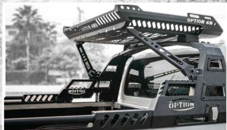
ROLL BAR V.1 WITH ROOF RACK OP237-001