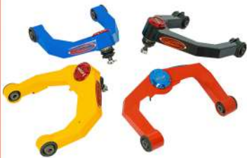
UPPER CONTROL ARMS V.2