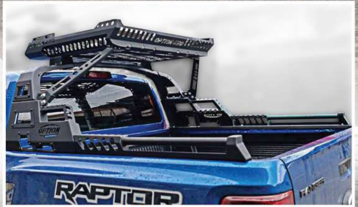
ROLL BAR V.1 WITH ROOF RACK OP237-001