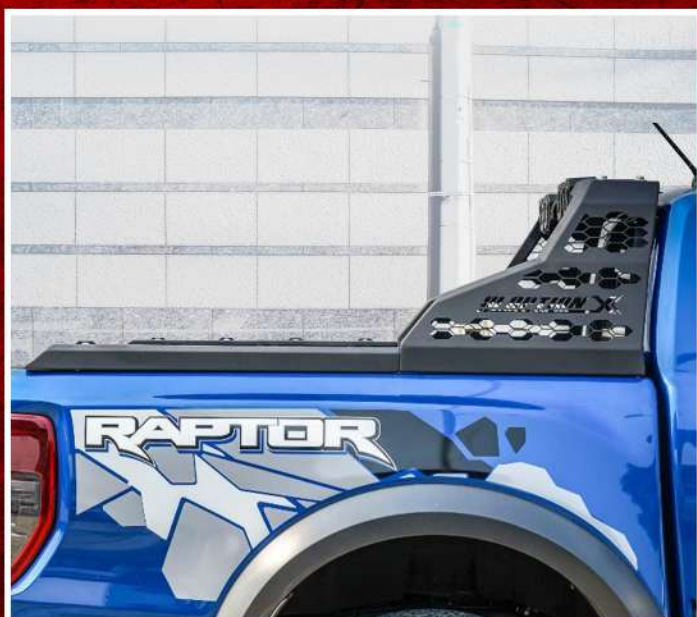
1. ROLL BAR OPTION X