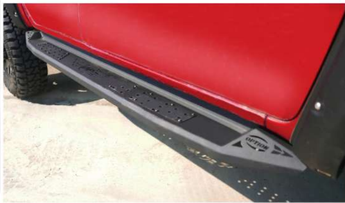
SIDE STEP V.1 OP250-01