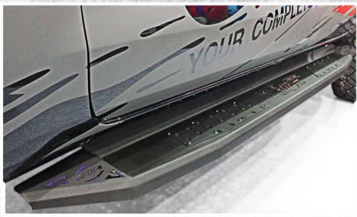
SIDE STEP V.1 OP271-01