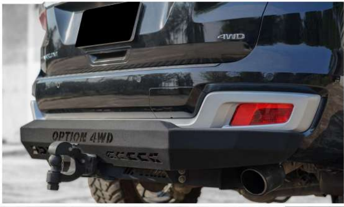
TOW BAR EVEREST OP324