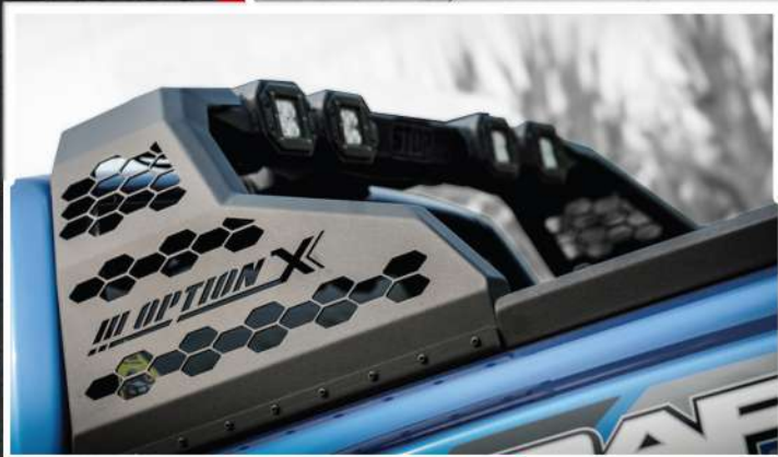
ROLL BAR OPTION-X OP330