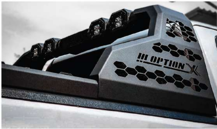
ROLL BAR OPTION-X OP330