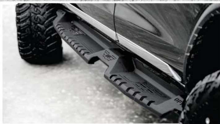
SIDE STEP V.2 OP359