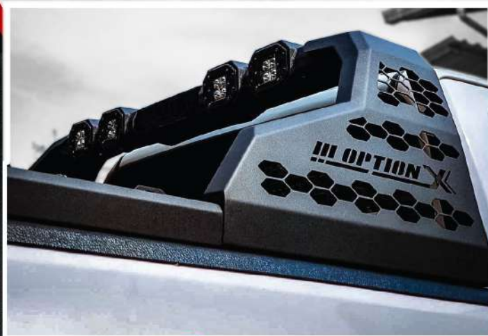
ROLL BAR OPTION-X OP330