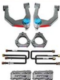
QUICK LIFT SET 2