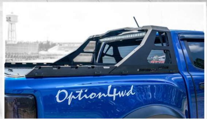
ROLL BAR PERFORMANCE OP374