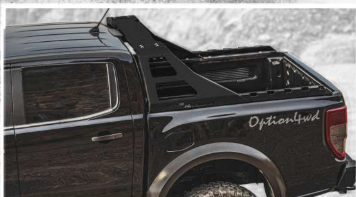
ROLL BAR OPTION PERFORMANCE OP374