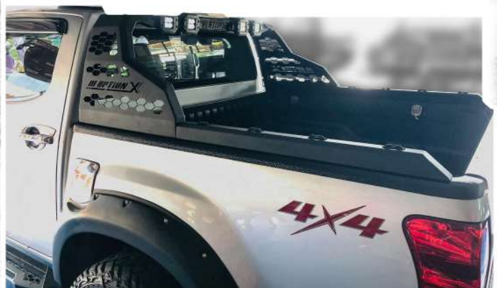
ROLL BAR OPTION-X OP330