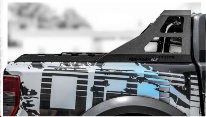
ROLL BAR PERFORMANCE OP374