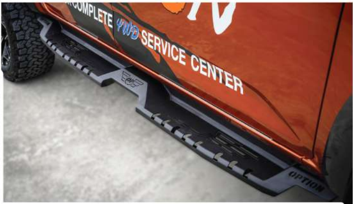
SIDE STEP V.2 2020+ OP278