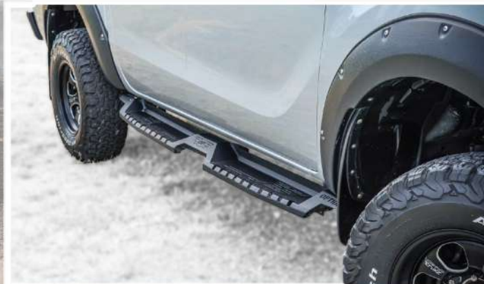
SIDE STEP V.2 OP250