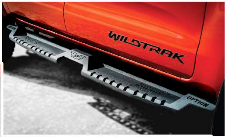
SIDE STEP V.2 OP250-01-01