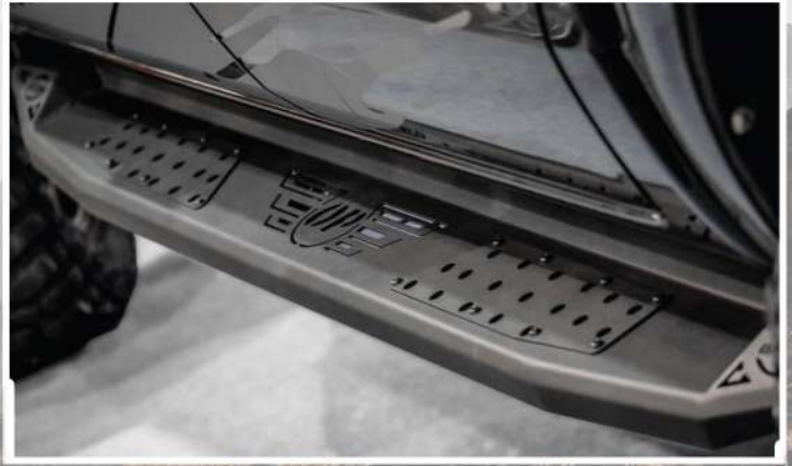
SIDE STEP V.1 OP25001