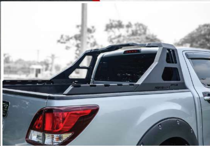
ROLL BAR PERFORMANCE BT-50 PRO / 2012-ON