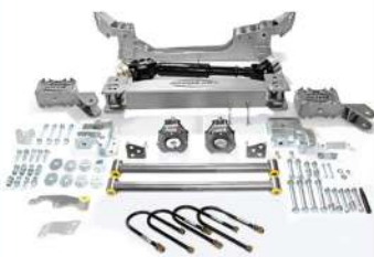
LIFT KIT 4 INCH