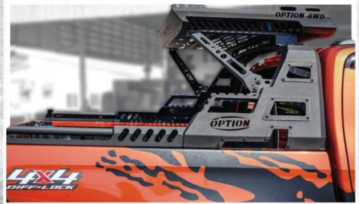
ROLL BAR V.1 WITH ROOF RACK OP237-001