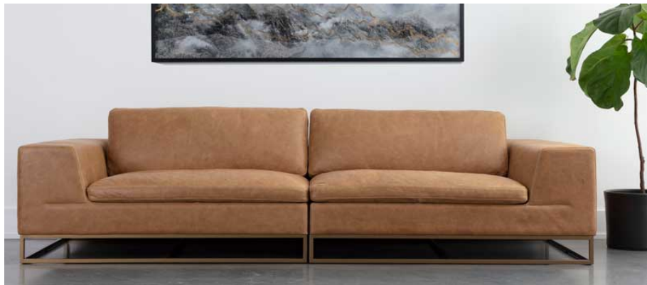
Ira Sofa in Camel leather

SUNPAN recently announced its newest introductions for the fall edition of High Point Market with new and on-trend styles.