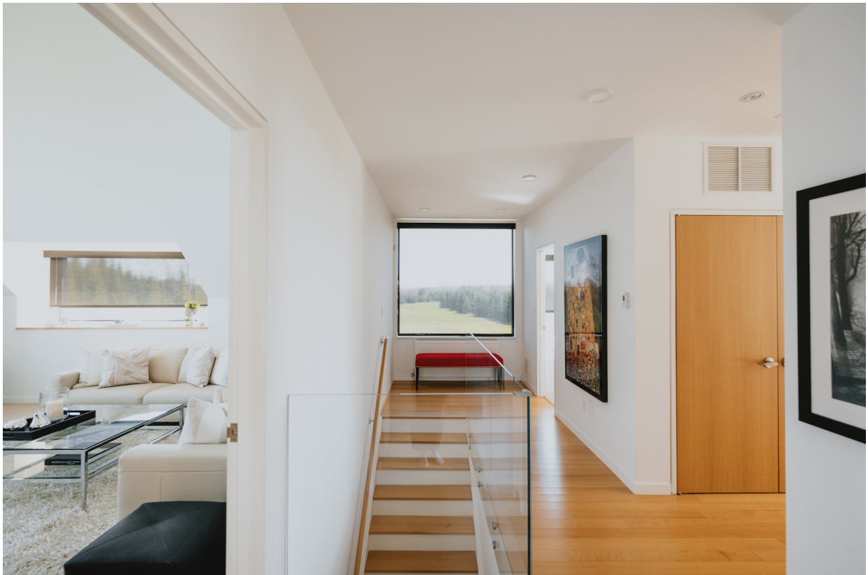
Here's their bedroom: