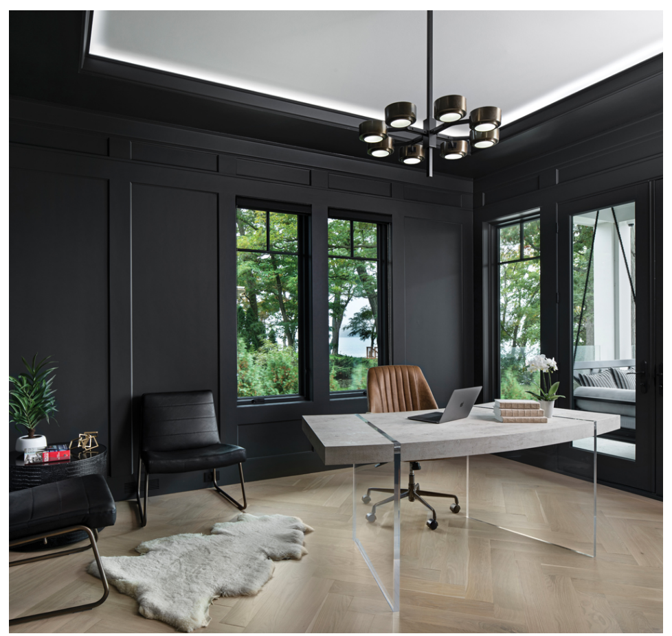
A pleasing mix of materials is showcased in the study, bar, and a dining area/game room.

The home is breathtaking, starting with the romantic, sweeping arch of the front entryway, where the lake shimmers across the great room beyond. A majestic fireplace with rift-cut, flipped-grain walnut paneling soars to the ceiling, and a huge modern chandelier adds warmth to the white walls. Indirect cove lighting adds dimension to the tongue-and-groove-paneled ceiling, and is nestled into the ceilings throughout the home.