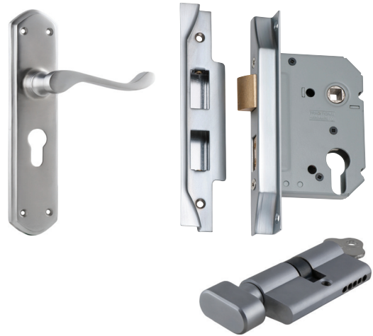
2179 Mortice Lock 5 Lever Rebated Satin Chrome CTC57mm Backset 57mm, 2053 Euro Cylinder Key Thumb 5 Pin Satin Chrome L60mm, 0892E Door Lever Windsor Euro Pair Satin Chrome H200 x P60 x W45mm

Further fitting instructions, templates, care and maintenance information and instructional videos can be found at our websites: tradco.com.au tradco.co.nz