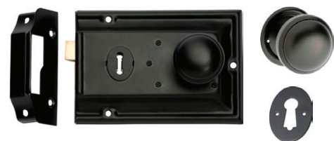
2013 Rim Lock, 0928 Door Knob Milled Edge Round Rose pair Matt Black D45xP46mm BP45mm