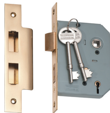
5 Lever High Security Lock in Polished Brass with 'Skeleton' Keys, 2143 Mortice Lock 5 Lever Polished Brass CTC57mm Backset 57mm

These can be 5 Lever High Security Locks, to be used on external doors, or 3 Lever Low Security Locks to be used on internal doors. The difference between 5 Lever and 3 Lever Locks is the number of different key combinations available. 5 Lever Locks also have an 'anti pick curtain', which makes it harder to access the working components in the lock once fitted inside your door, in addition to reinforced steel pins through the locking bolt. They are suitable with any of our door furniture labelled 'Lock' in the description. These locks are supplied with a 'skeleton' key 9 . 5 Lever Locks have the same level of Security as Euro Locks. The main difference is that the 3 and 5 Lever Locks are more 'traditional' for period homes. These locks can be supplied keyed alike.