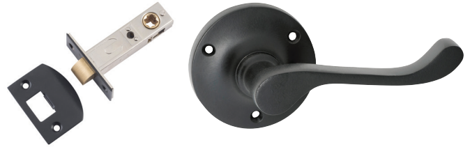
Tube Latch with 9586 Victorian Round Rose in Matt Black

This is used when the door doesn't need to be locked. It can be used with any type of door furniture, whether it's long back plate 1 , short back plate 2 , lever 3 , or knob 4 on rose. Latch simply means you need a Tube Latch 5 to make your door furniture functional.