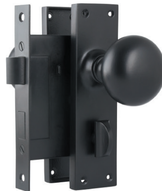
2263 Privacy Lock with a 0959P 'Victorian Knob' in Matt Black