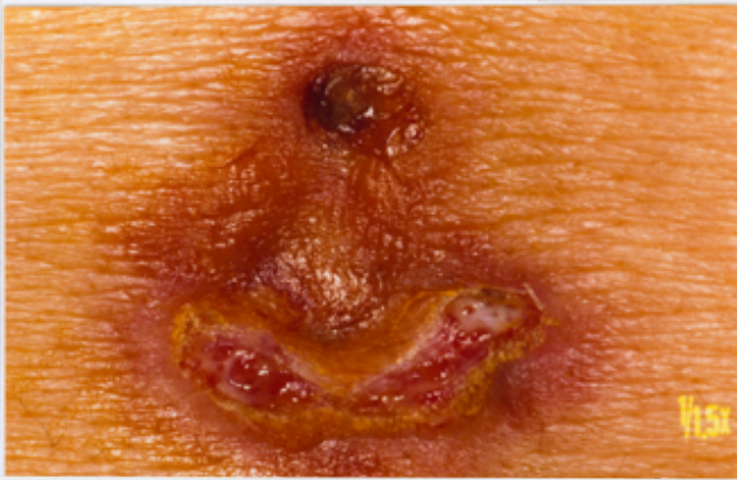
Before Bioptron treatment