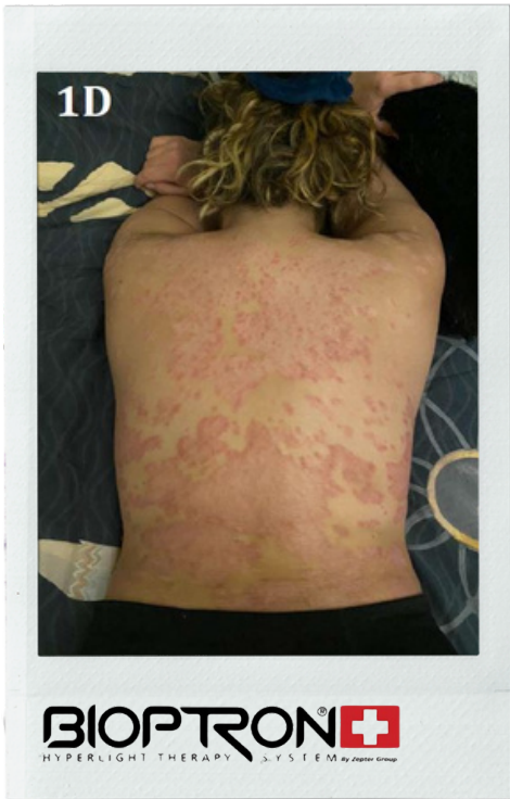
9 days of treatment