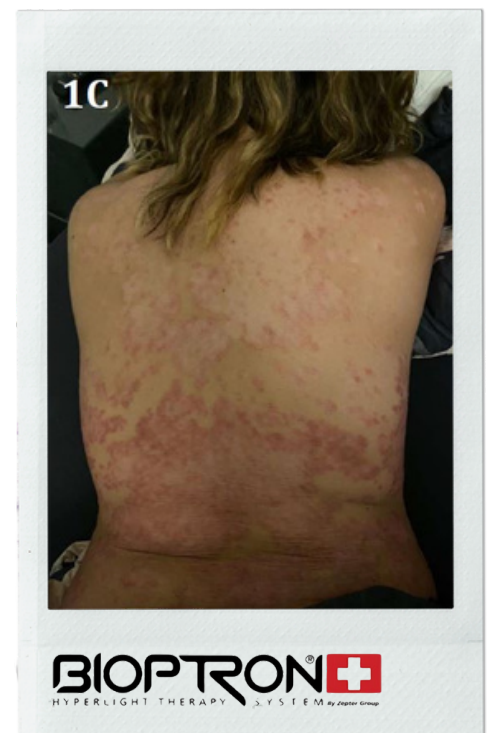
6 days of treatment