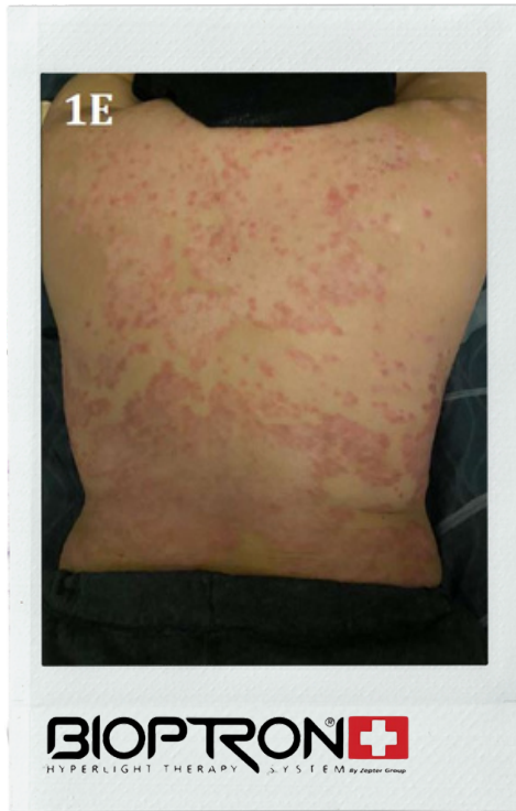
12 days of treatment