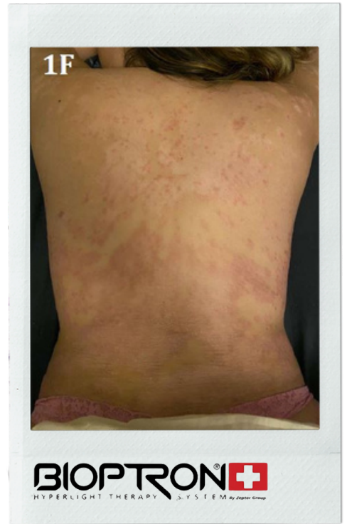
15 days of treatment