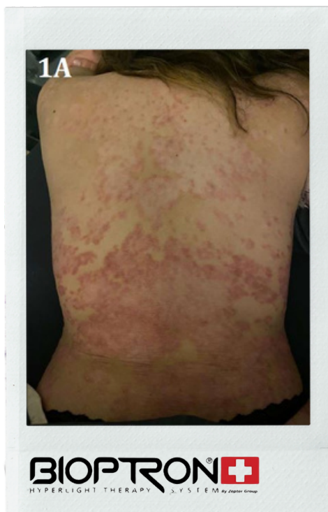
Start of treatment

After 17 days in total, the patient's back has recovered drastically. The redness almost completely vanished, there are no pustules, and the repaired skin is smooth and without inflammation.