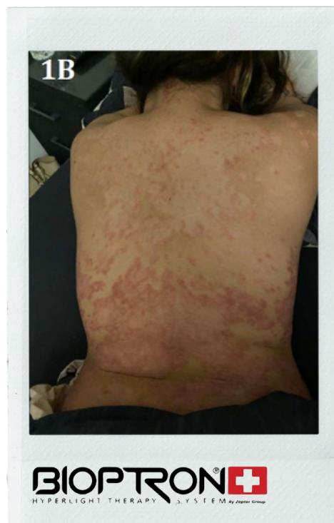
3 days of treatment