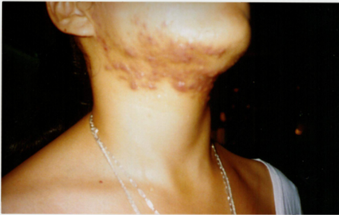
After 3 weeks of Biopton treatment