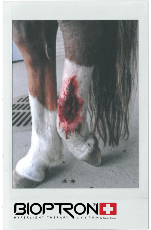
1 month after accident