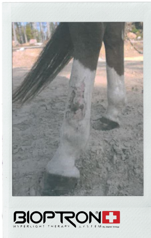
8 months after accident