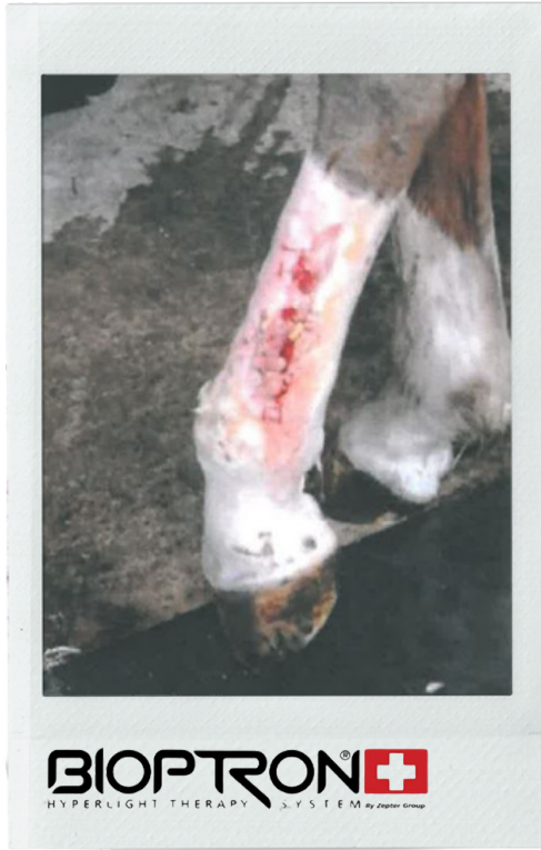
2 weeks after accident