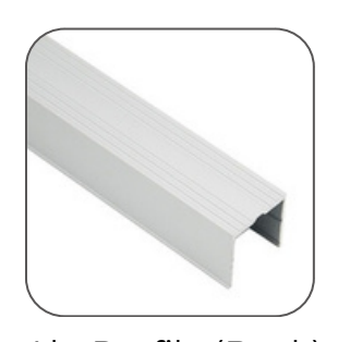
Alu Profile (Back)