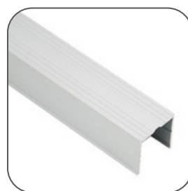
Alu Profile (Back)