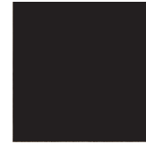
Black Steel Legs