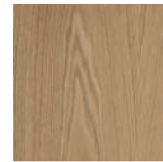
Solid Oak Legs