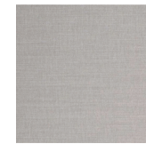
Upholstered divider Fabric of your choice