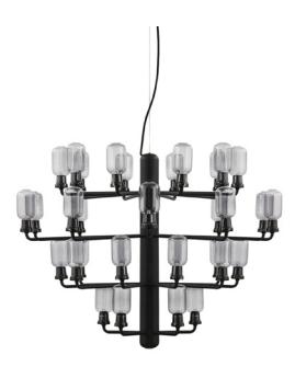
Amp Chandelier large H: 62,5 x Ø85 cm