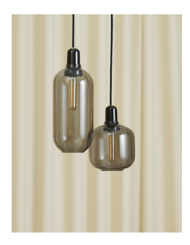
Amp Pendant Large and small smoke glass / black marble