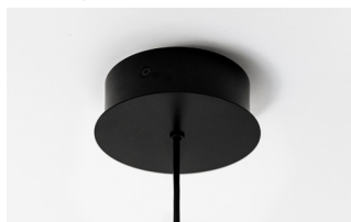
D135 | Ø13.5 X 4.5CM

B. We can also provide builtin LED drivers with 1-10 Volt, Switch / Push or DALI dimming, if required by your electrician. These drivers are larger and require a D135 canopy. These dimming and canopy combinations are available in the following finishes: