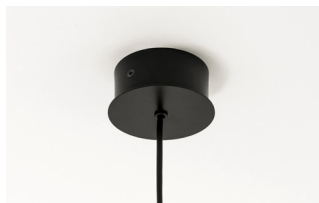
D95 | Ø9.5 X 4CM

A. We provide a D95 canopy with a builtin LED driver with phasecut dimming as standard. This dimming and canopy combination is available in the following finishes: