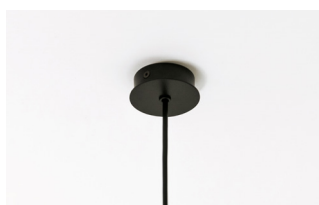
D70 | Ø7 X 2CM

B. If your electrician can wire the LED Drivers remotely (rather than builtin to the canopy) we can provide a D70 canopy for solid ceilings or D50 for false ceilings. These dimming and canopy combinations are available in the following finishes: