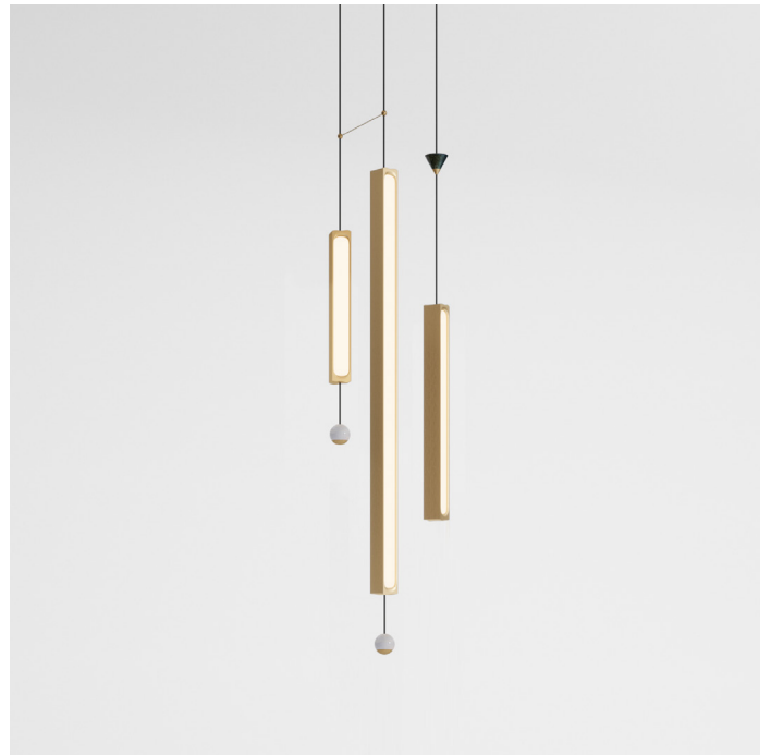
MILKY WAY CHANDELIER VERTICAL 165

Strip LEDs, 144.8W, 11870 Lumens, 2700K warm white. CRI>90.