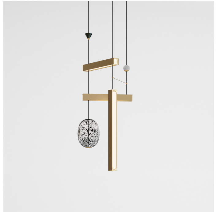
MILKY WAY CHANDELIER VERTICAL 125

Strip LEDs, 60.1W, 4920 Lumens, 2700K warm white. CRI>90.