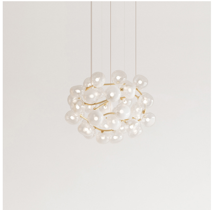
MAEHW A CHANDELIER SPHERE 37

37 Proprietary Maehwa LEDs. 33.2 W, 4510 lm, 2700K warm white. CRI>95. Energy label A.