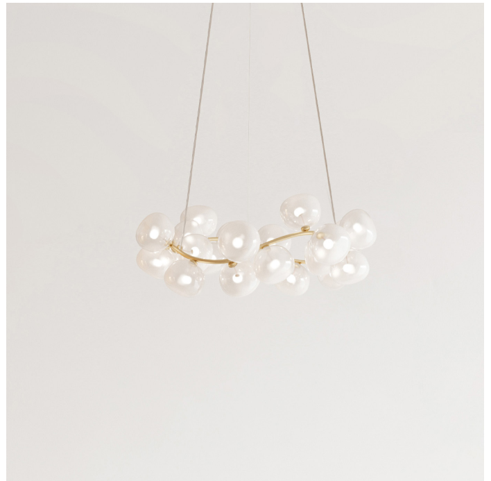
MAEHWA CHANDELIER RING 22

23 Proprietary Maehwa LEDs. 18.2 W, 2680 lm, 2700K warm white. CRI>95. Energy label A.