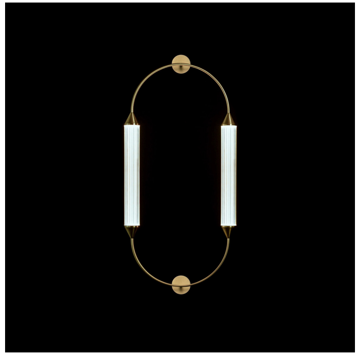
CIRQUE CEILING/WALL ELLIPSE