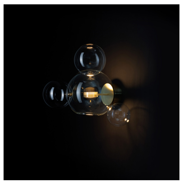
BOLLE WALL 4 BUBBLES