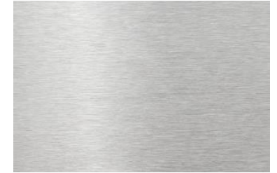
Stainless Steel The ultimate in durability