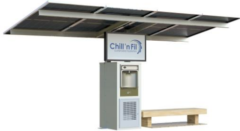
GT-2200 with media and shaded bench