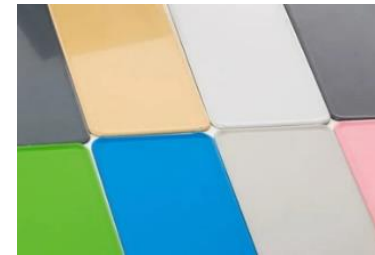
Powder Coated Steel Wide color selection