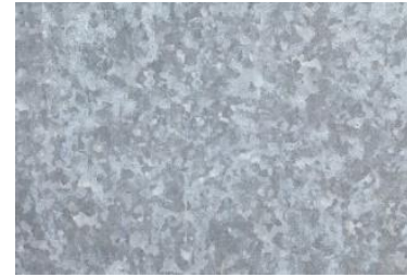
Galvanized Steel Utilitarian and low cost