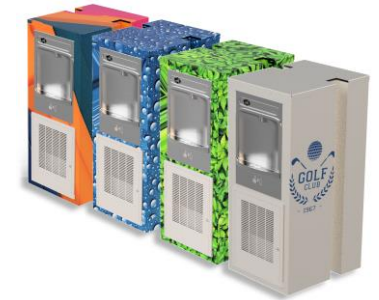
Vinyl Wrap Artistic and attractive

Note: All models are available as stand-alone solar systems with batteries, when no power is available, or as grid tied systems that produce supplemental solar power. With grid tied systems there is no wasted energy, excess electricity is fed back into the grid and there is a lower initial cost compared to battery-equipped systems.