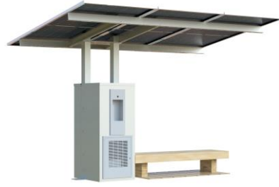
SA-1650 with shaded bench