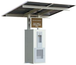
SA-1100 with donation plaque