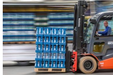
Transport and Delivery