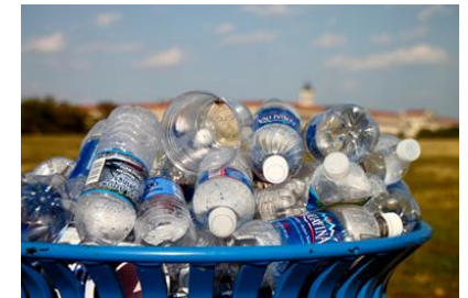
Plastic Waste Removal