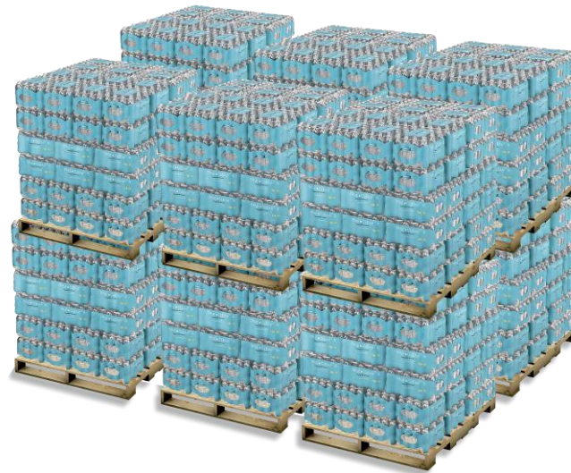
A year's worth of bottled water