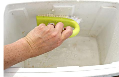
Clean-up and Maintenance