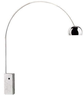
FU030000 Stainless steel