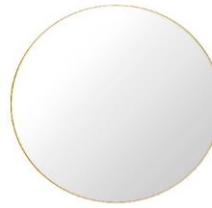
// Polished Brass