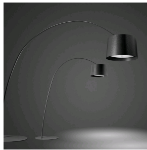
Twice as Twiggy