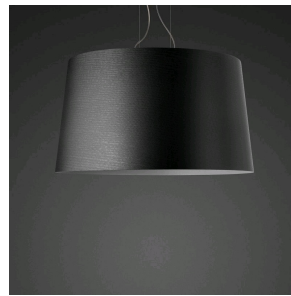
Twice as Twiggy