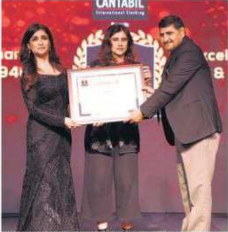
Singer-artist Shibani Kashyap and fashion designer Rina Dhaka present Greenways the award for Excellence in Craftsmanship & Design, Since 1946.