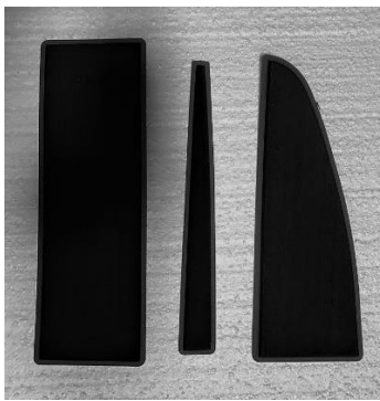
DRIVER'S SIDE STORAGE COMPARTMENT