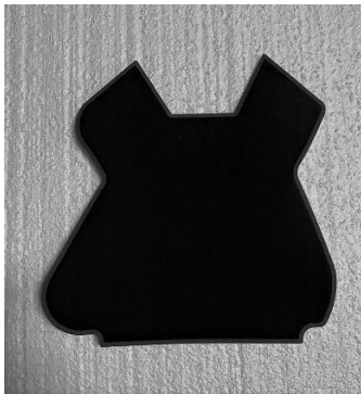
GLOVE BOX LINER

Sort all pieces within the kit to familiarize yourself with them and where on the bike they need to be applied. All components to this kit are cut specifically for individual positions on the bike. Refer to the photos below for added assistance.