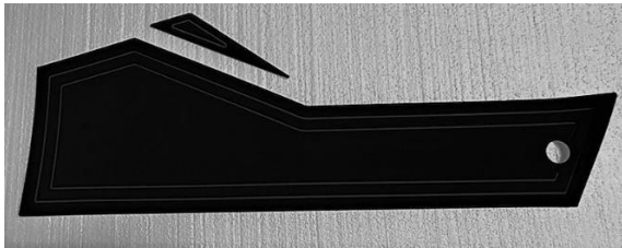
DRIVER'S SIDE TRANSMISSION TUNNEL