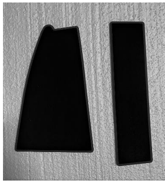
PASSENGER'S SIDE STORAGE COMPARTMENT