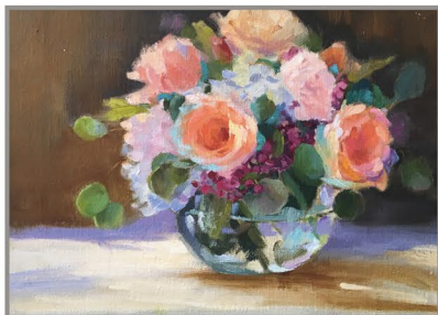
"SUMMER COLORS" 9X12 OIL