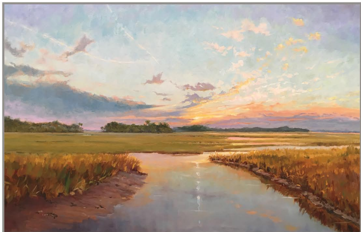
"ISLAND SUNSET" 24X36 OIL