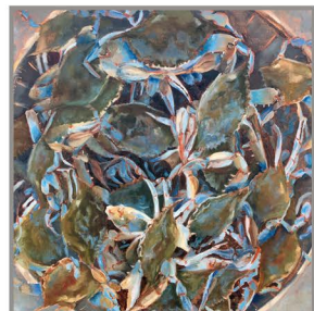
"BLUE CRABS" 20X20 OIL