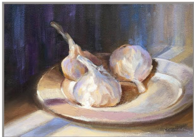
"FLAVOR" 8X10 OIL