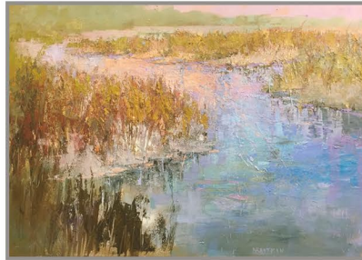
"WINTER WETLAND" 40X60 OIL