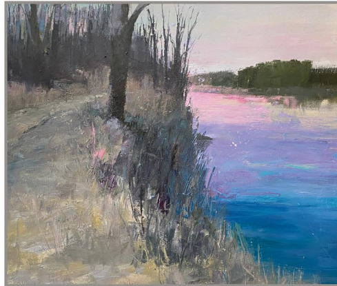
"PRYOR'S GARDEN III" 54X54 OIL