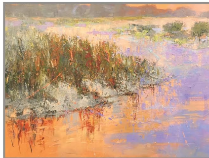
"TANGERINE" 40X60 OIL