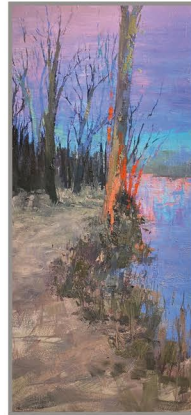
"PRYOR'S GARDEN VI" 54X24 OIL