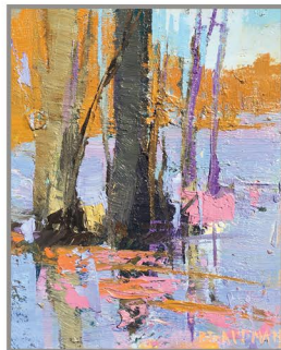
"PALETTE STUDY II" 10X8 OIL