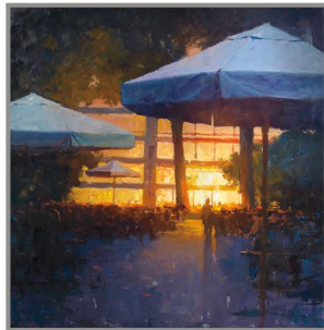
"UMBRELLA ELLA ELLA" 36X36 OIL