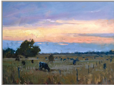
"EARLY BIRD SPECIAL" 12X16 OIL