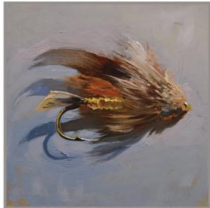
"MUDDLER MINNOW" 8X8 OIL