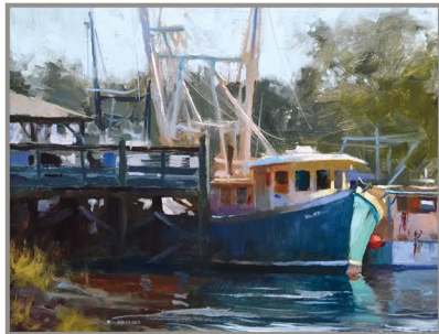
"GREEN MACHINE" 11X14 OIL