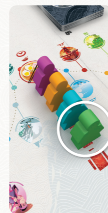
The green traveler will be the first one to leave the Inn.

The first traveler occupies the space nearest the road, and later travelers form a line after him.