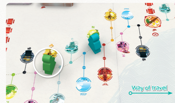
The Green traveler is farthest behind on the road, so he starts.

Sometimes the last Traveler may still be last after moving, in which case he goes again immediately.