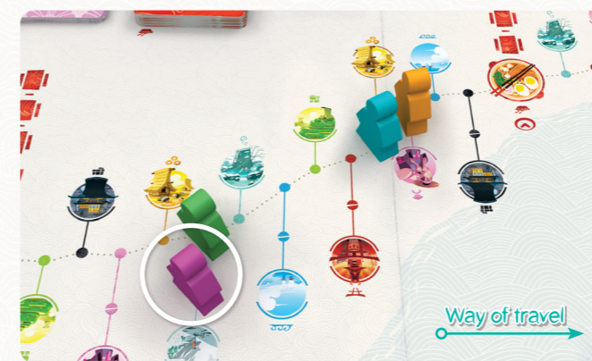
The Purple traveler is farther behind than the Green traveler, therefore he starts.