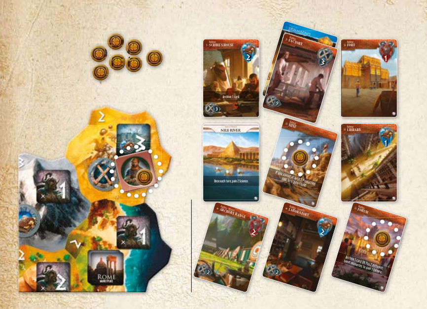
Use action markers to show that a card effect or Explorer action has been used this round

WHENEVER YOU USE THE EFFECT OF A CARD OR TAKE AN ACTION WITH AN EXPLORER, PLACE AN ACTION MARKER ON it as a reminder that its effect has already been used this round — you cannot use it again on a future action in the same round.