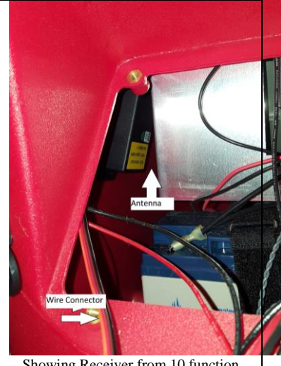
Showing Receiver from 10 function remote (physical remote assembly).

Press the remote Wi-Fi module firmly against the left side of the case.