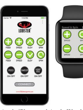
Apple iPhone and Apple Watch are