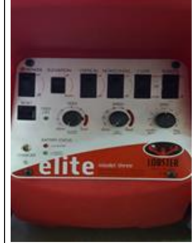
Control Panel with screws in place.

Replacing and Installing a 10 Function Remote Control EL24 and or Wi-fi EL24.WF