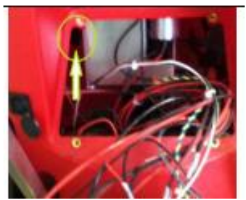
Wi-Fi Module installation location (left hand side of the red case towards the middle).