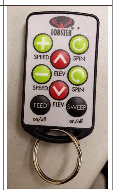
10 Function remote transmitter (does NOT have Wi-Fi capability).

Open the Lobster elite remote control app on your device and allow up to 90 seconds for your device and machine to sync — they are connected when the remote CONNECT/DISCONNECT button says DISCONNECT.