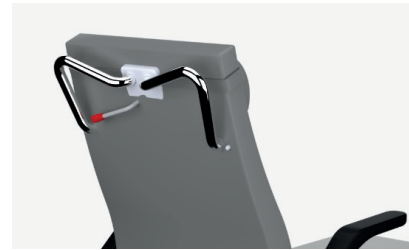
Emergency Positioning CPR Lever