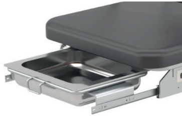
Stainless Steel Removable Basin