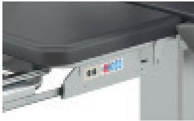
Dual Membrane Side Control Switches