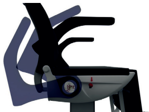
Barrier Free Adjustable Armrests