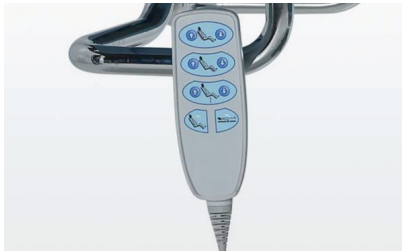
Hand Control Unit