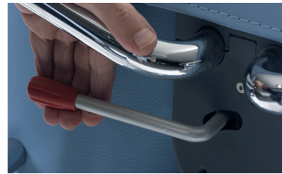
Emergency Positioning CPR Lever