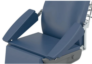
Barrier Free Adjustable Armrests