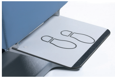
1. Foot Support Platform