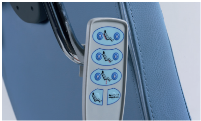
Hand Control Unit