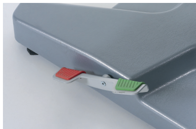
Retracting Positioning Wheels