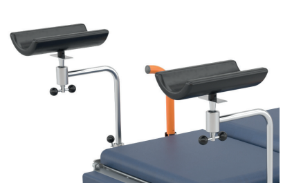
Articulating Universal Legholder