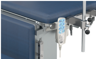
Hand Control Unit