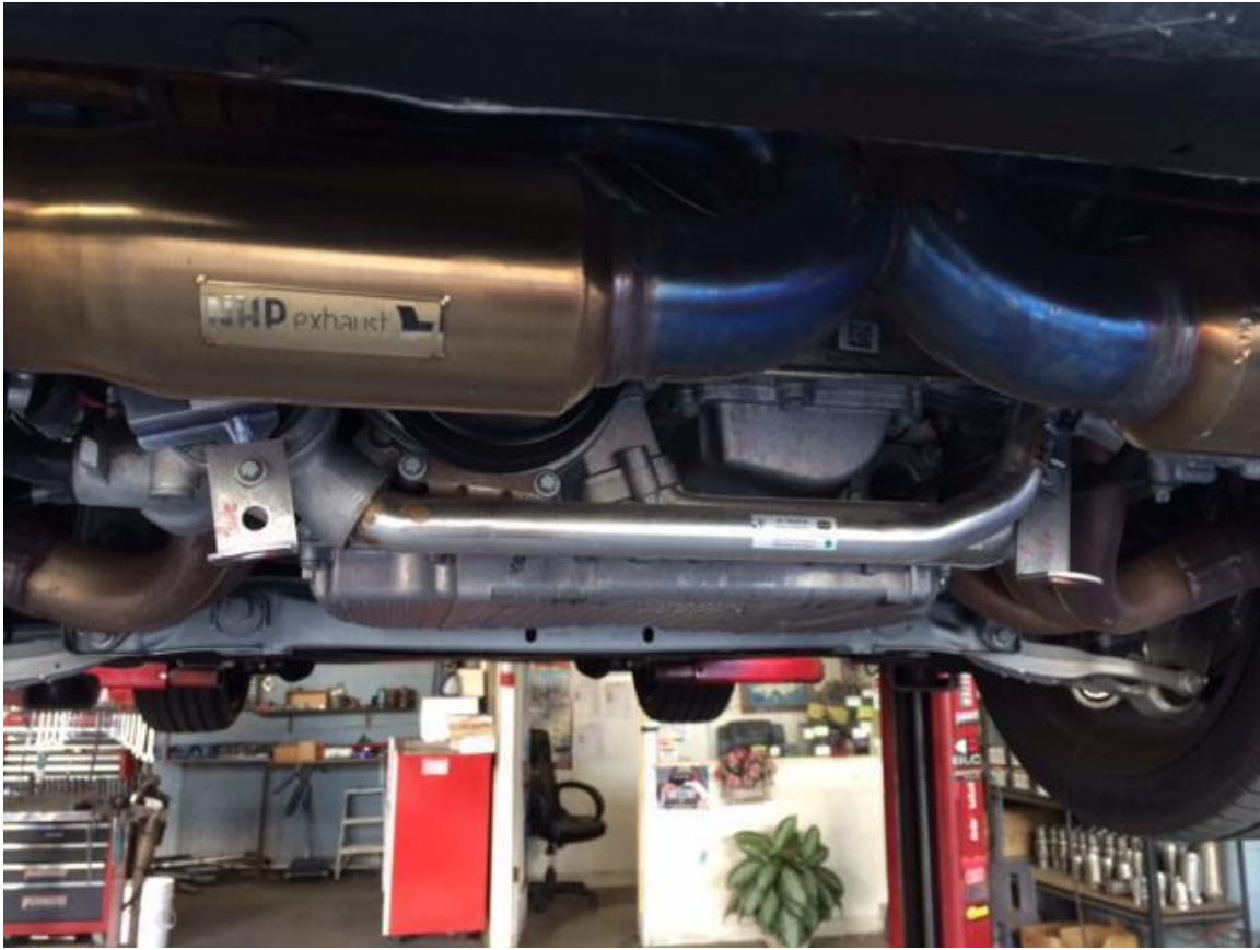
Attaching points for rear diffuser brackets