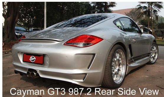
Cayman GT3 987.2 Rear Side View