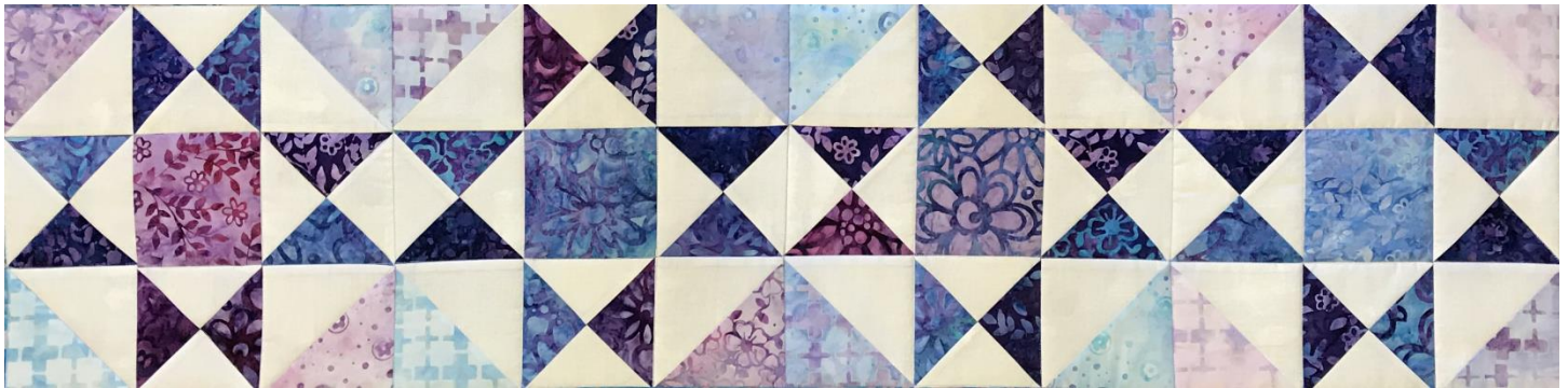
Table Runner: Stitch 4 blocks together.

Border: Cut 4@2 ½” WOF. Stitch onto all 4 sides of runner. Backing: Cut 2@17” WOF and stitch together into one long piece. Use Flip Finish method as described above. Quilt as desired and steam press.