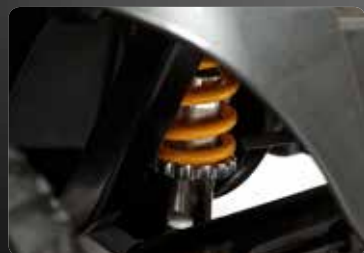
Pride's CTS Suspension

Exclusive stylish, lightweight, non-scuffing, black, low-profile tires