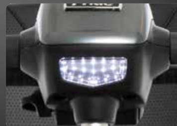
LED headlight in tiller

Experience the Revo™ 2.0, the most impressive mid-size scooter that combines an array of features into one great package. Tough and built to last, the Revo 2.0 offers rugged dependability you expect from luxury mid-size scooters. Comfort-Trac Suspension (CTS) ensures a smooth and comfortable ride over varied terrain. Experience convenient, feather-touch disassembly for portability that is comparable to our Travel Mobility line. Enjoy standard under seat storage and speeds up to 5 mph.