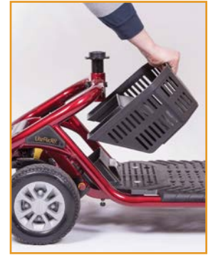
Remove the baskets from under the seat and from the tiller (not shown)