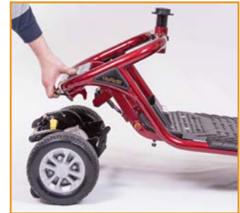
While squeezing the release lever, pull up on the rear frame