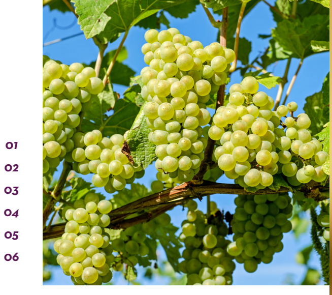
★ = Included in 6 bottle mixed case