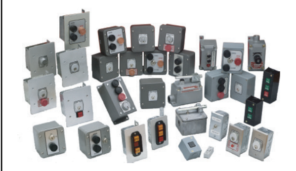
Complete selection of control stations & accessories are available.