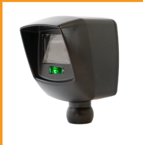
Integrated Sensor Hood