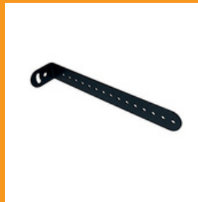
Reflector Extension Bracket