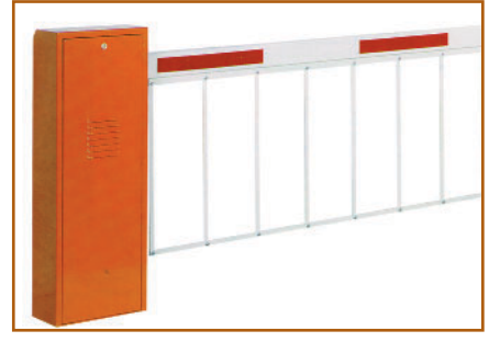
Skirted beam kit