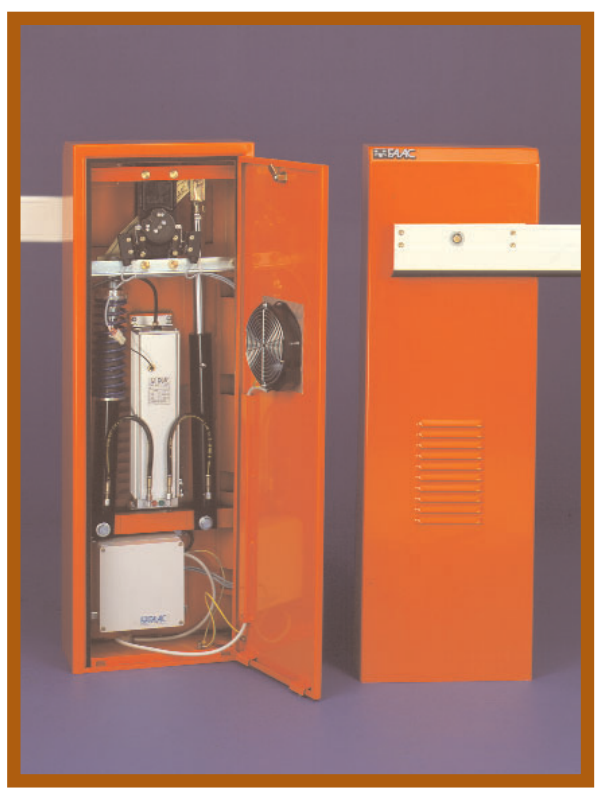
Model 640 Hydraulic Barrier Gate Operator