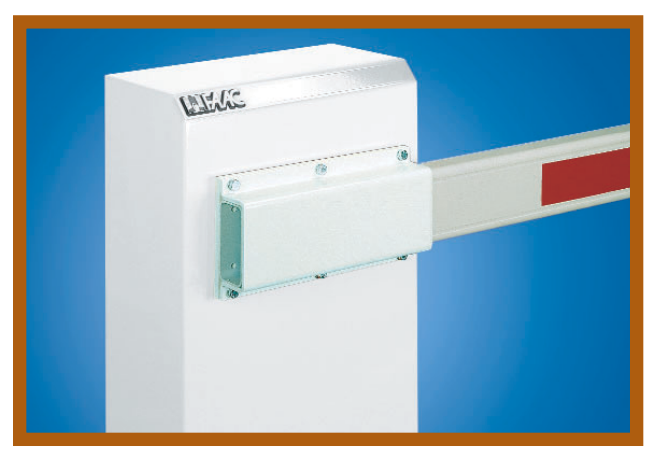
A white cabinet can be substituted for the standard FAAC orange at no extra charge

FAAC is the world's largest specialized manufacturer of automatic gate operating equipment.