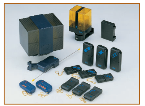
Access control accessories

Note: Operator specifications are approximate. Environmental factors can change the performance of the operator. Your installer will advise you regarding which model of operator will work best for your site and application.