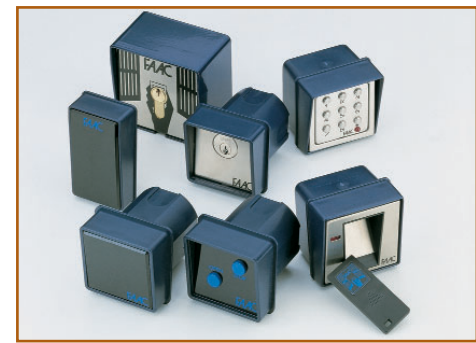
Access control accessories