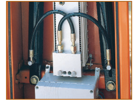
Anti-vandalism valve. Protects the integrity of the hydraulic system if the beam is forced.