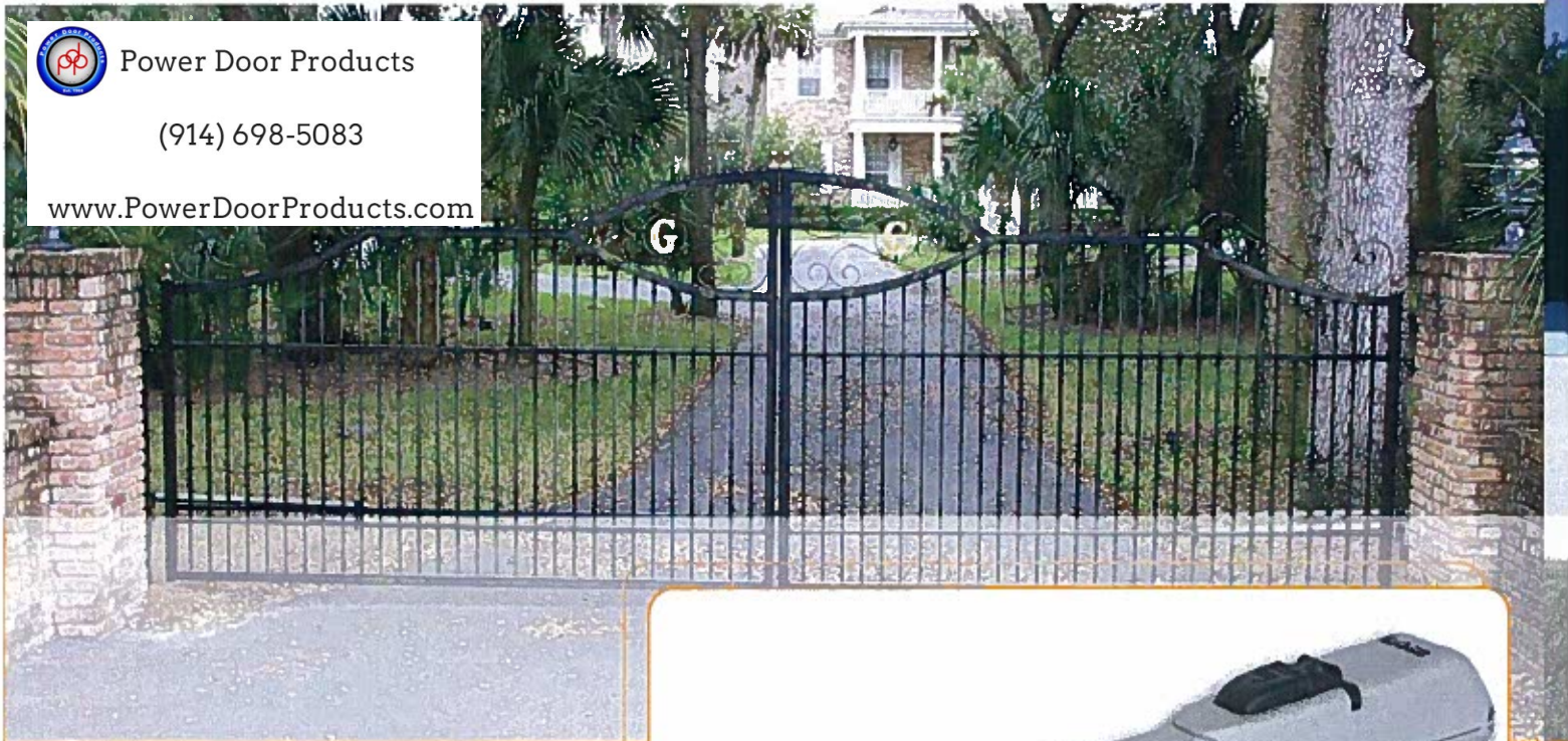
Model 415 Low voltage swing gate operator